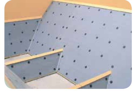
MATROX LINING INSTALLED TO MANUFACTURERS RECOMMENDATION POLYSTONE UHMWPE FENDER