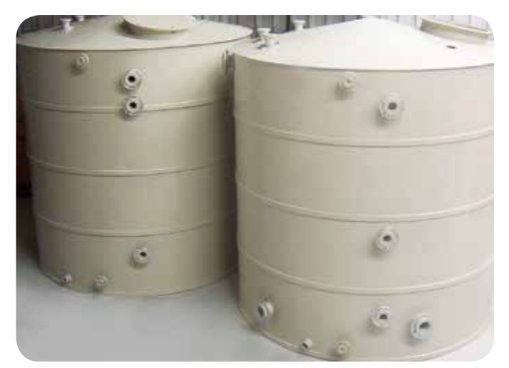
PP & HDPE SHEET FOR CHEMICAL STORAGE TANKS