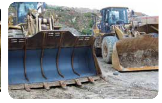
MATROX LINERS TO REDUCE HANG UP

DOTMAR ... your partner in performance plastics.